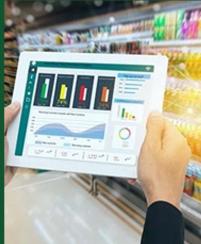
Stock Loss Management