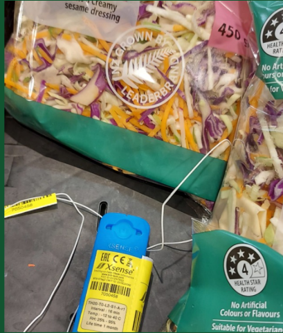
Smart Temp Tracking